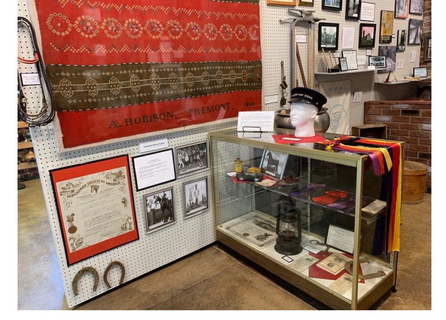
Robison display at the Tremont Agricultural Heritage Museum